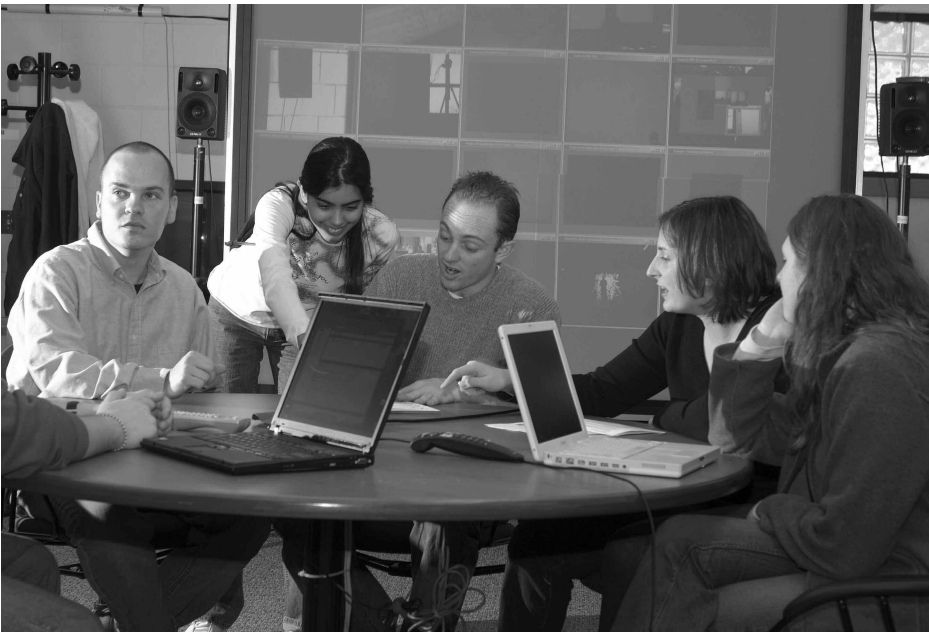
Informatics students are problem-solvers and team players.

Based on superior performance and in accordance with Indiana University–Purdue University Indianapolis policies, the program faculty will recommend that qualified students be awarded degrees with distinction.