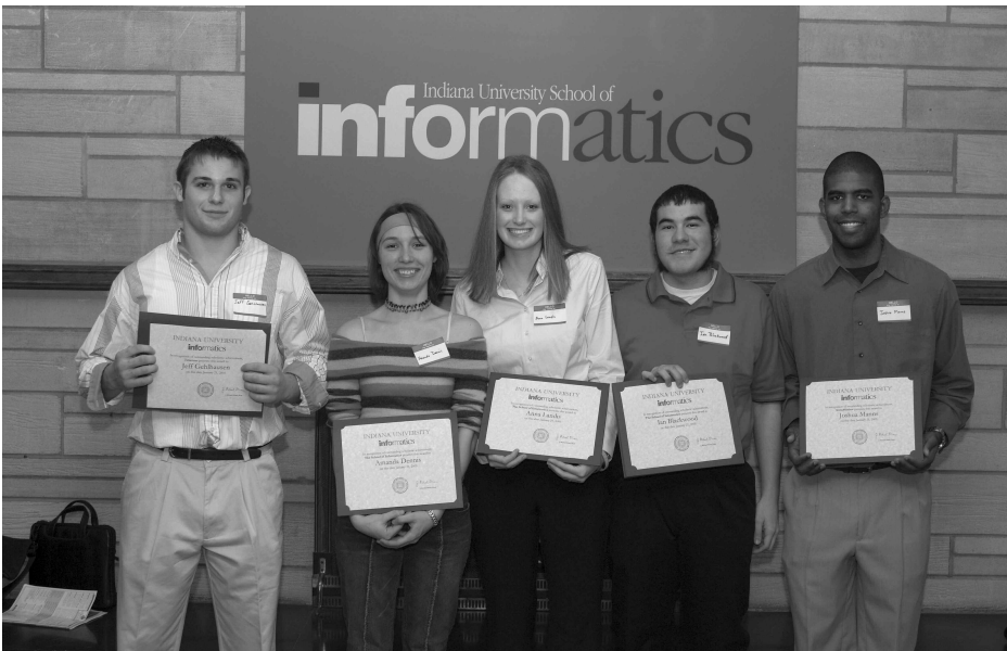
Undergraduate students are honored with scholarships to further their informatics studies.

N302 Media Simulation Methods (3 cr.) P: N101. A study of the fundamentals and methods of building and using computer-based simulation models, including the utility of simulation as a decision support tool, representing queuing systems in a computer model, simulated sampling from distributions of input variables, point and interval estimates of expected values of output variables, and the design of simulation sampling experiments. [3-D Studio Max II]