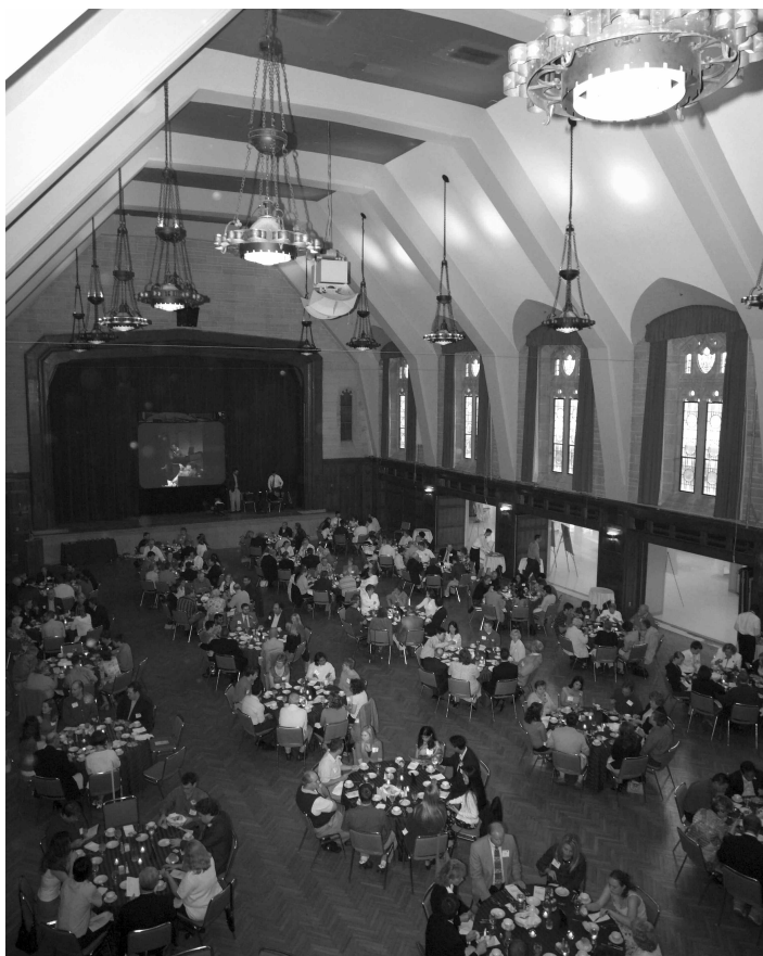
Reception for the 2005 graduating students.

Variable topic. Emphasis is on new developments and research in informatics. Can be repeated twice for credit when topics vary, subject to approval of the dean.