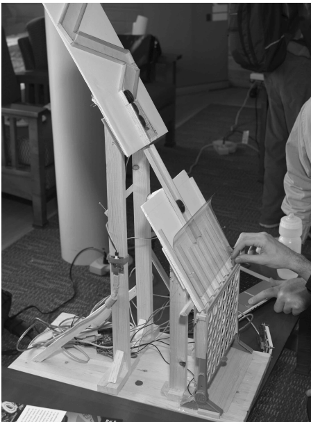
Informatics seniors participate in capstone projects, working with community businesses to gain real-world experience.

12 of the 23 credit hours must be completed at the 300 level or above.