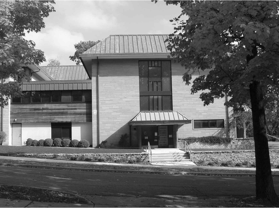
School of Informatics, IUB