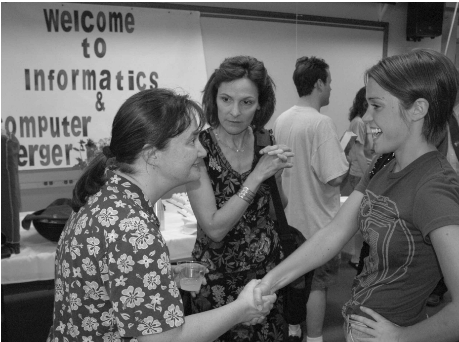
In July of 2005 the Department of Computer Science merged with the School of Informatics.

Research and theory in informatics move rapidly to application and development. The faculty who teach in the School of Informatics participate in research activities and new applications of technology. As a result, faculty can transmit state-of-the-art knowledge to their students. Indiana University is capitalizing on this great research strength in informatics at both IUB and IUPUI with the formation of the Informatics Research Institute (IRI). The IRI conducts research in areas of emphases shared with the School of Informatics, including fundamental research in human-computer interaction; fundamental research in capturing, managing, analyzing, and explaining information and making it available for its myriad uses; and expanding research into policy and socioeconomic issues arising from information technology.