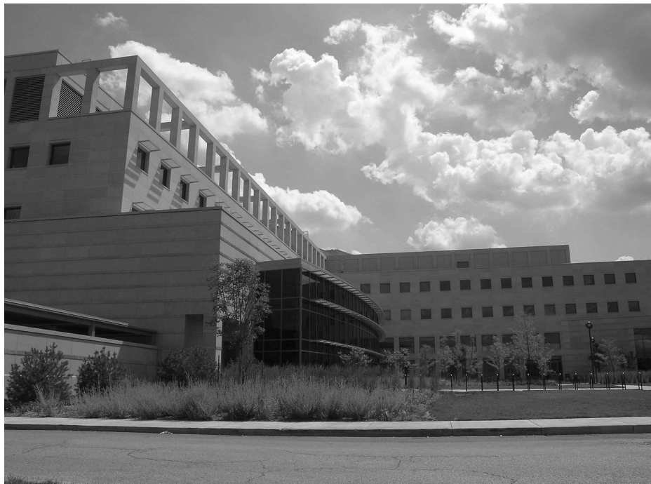
Informatics and Communications Technology Complex, IUPUI

INDIANA UNIVERSITY BULLETIN OFFICIAL SERIES (USPS 262440) ISSN 0-888-5338